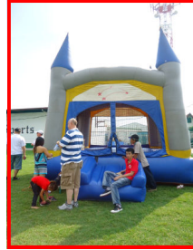
Bouncy Castle one of the children activities.