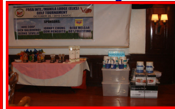
Tournament trophies and raffle prizes.