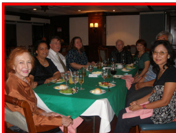
American Association of the Philippines Officers and their guests.