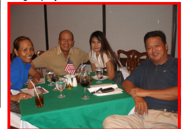
Pacquiao VS. Margarito PPV crowd at the Club.