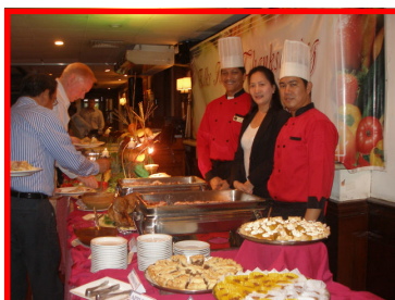
Thanksgiving Buffet Table